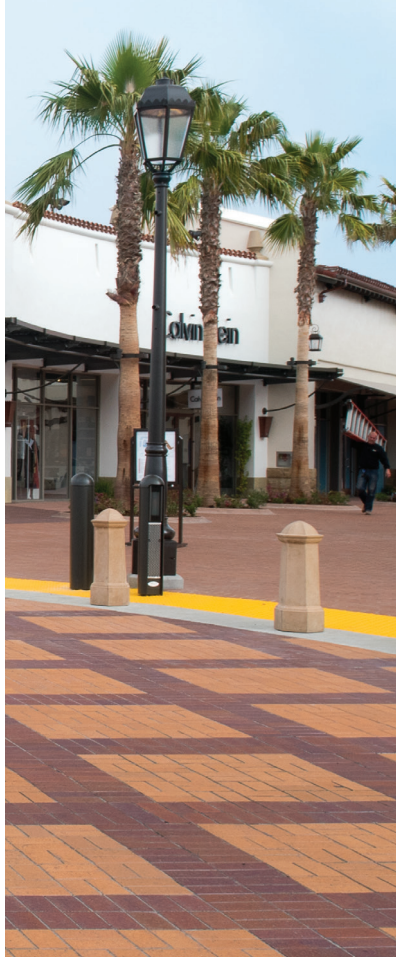
SAN CLEMENTE CALIFORNIA