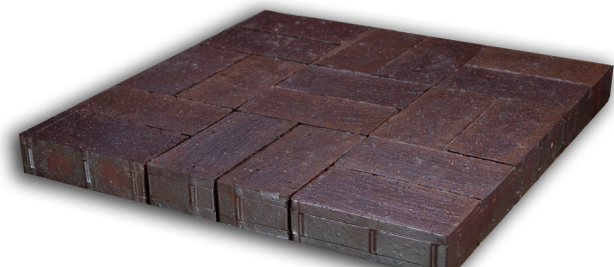
Medium Ironspot #46