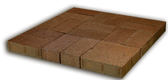
Medium Ironspot #77